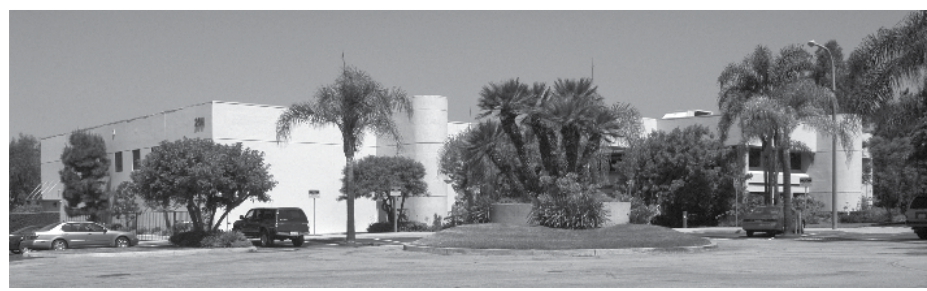
Worldwide Church of God headquarters in Glendora, CA, viewed from the southeast.