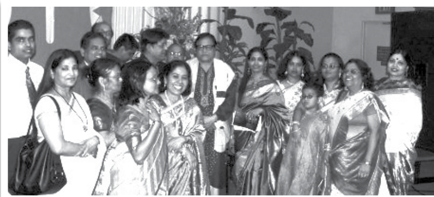
Some of the participants in the Bengali Easter program.