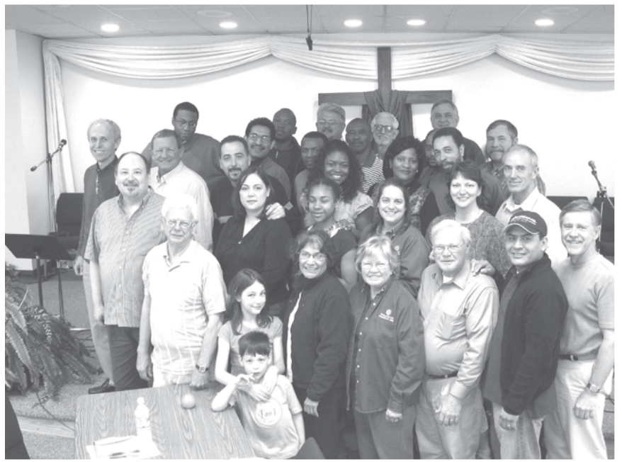
Participants in the New Church Leadership Training conference in Memphis, TN, March 21-24

Unless noted otherwise, scriptures are quoted from the Holy Bible, New International Version. Copyright © 1973, 1978, 1984 International Bible Society. Used by permission of Zondervan Bible Publishers.